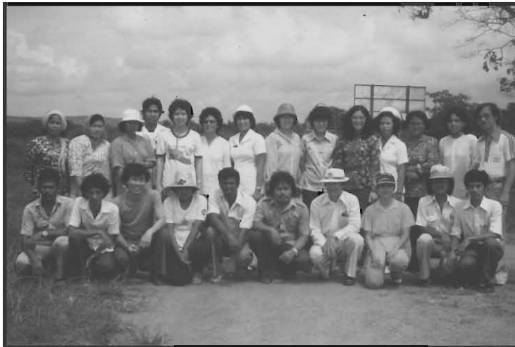
IMR Nutrition Survey Team