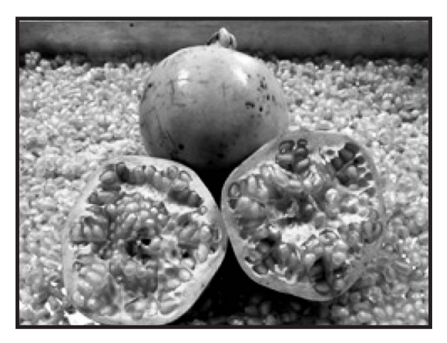
Figure 1. Pomegranate fruit (Punica granatum).